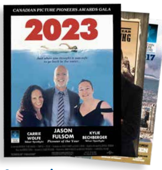
See previous years Awards Programs